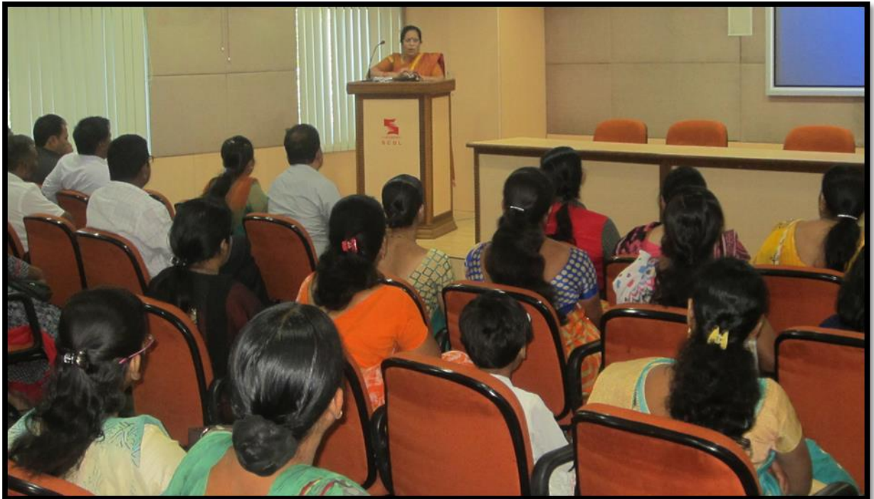
Respected Principal Madam addressing the parents in PTA