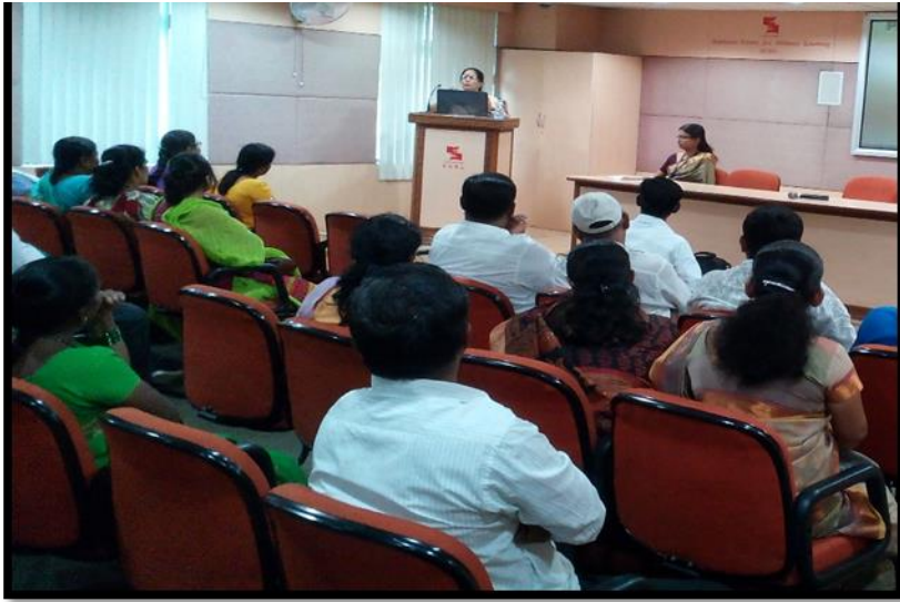
Respected Principal Madam interacting with parents