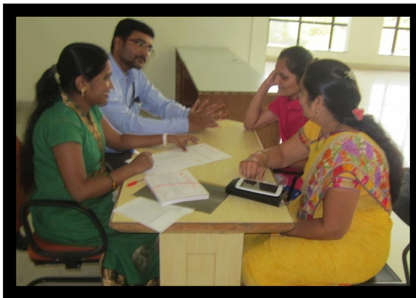
Teachers discussing the performance of the student with parents