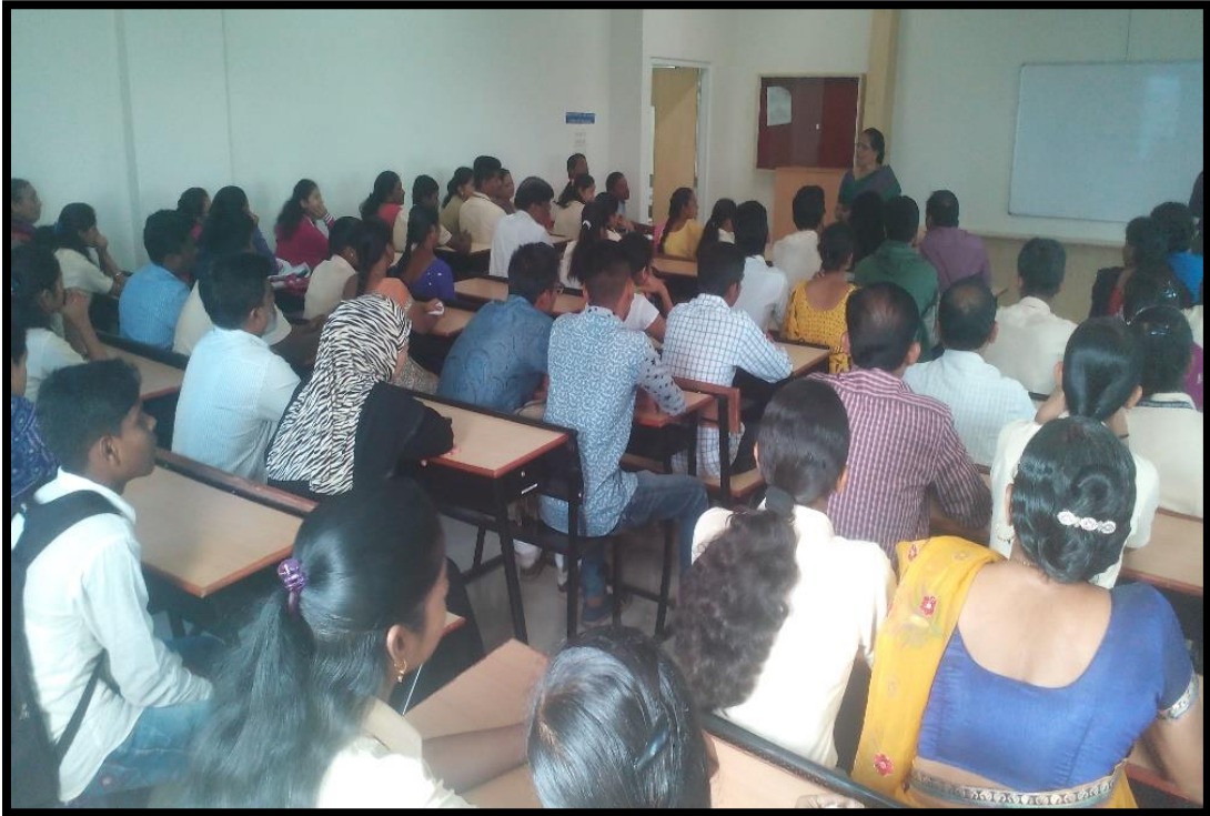
Parents thanking & appreciating & the respected Principal Madam for the performance of SVJC in the academic year 2016-17.