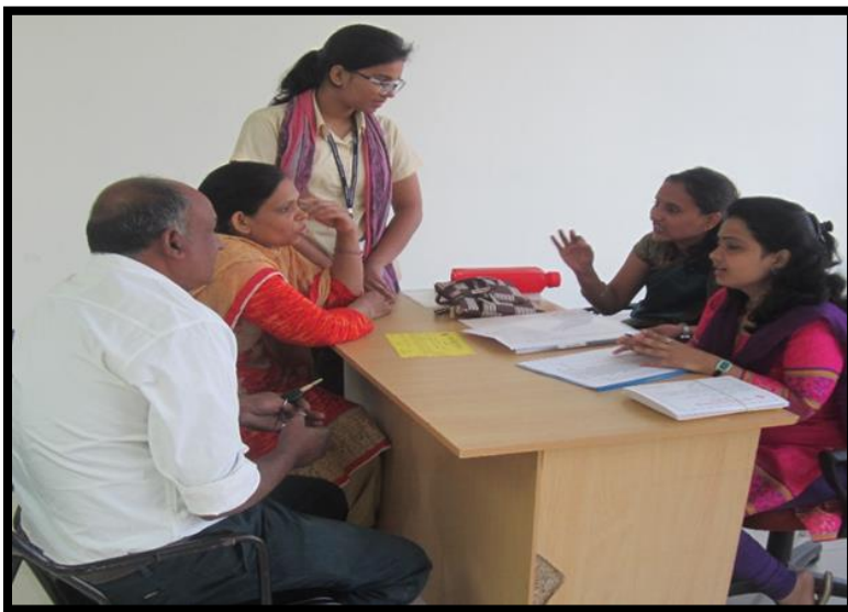
Individual Parents- Teacher interaction in PTM